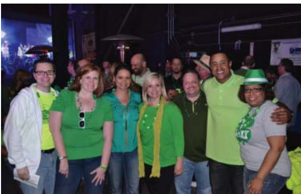
Georgia's Own was proud to be the presenting sponsor of ShamRockin' for a Cure, held on March 8th at the Verizon Amphitheater